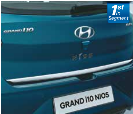
Rear Chrome Garnish

Roof Rails | Air Curtain | Sporty Rear Skid Plate | Turn Indicators on Outside Mirrors