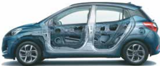
Strong Body Structure-65% (AHSS + HSS)