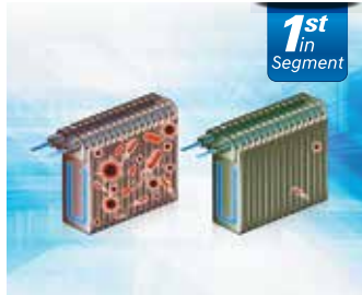
Eco Coating Technology