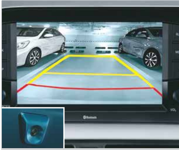
Rear Parking Camera with Display on 20.25 cm Screen

Speed Alert System | Front Seatbelt Pretensioner with load limiters | Rear Defogger Impact Sensing Auto Door Unlock / Speed Sensing Auto Door Lock | Headlamp Escort Function