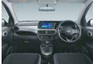
Black Interiors with Aqua Teal Inserts available in :