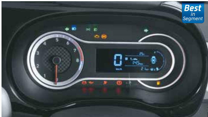
13.64 cm Digital Speedometer