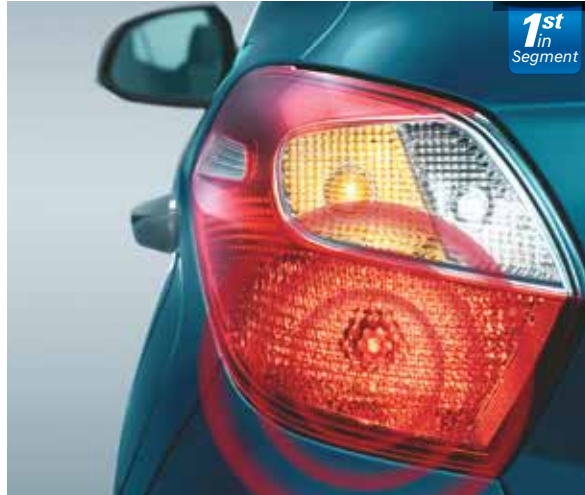
Emergency Stop Signal