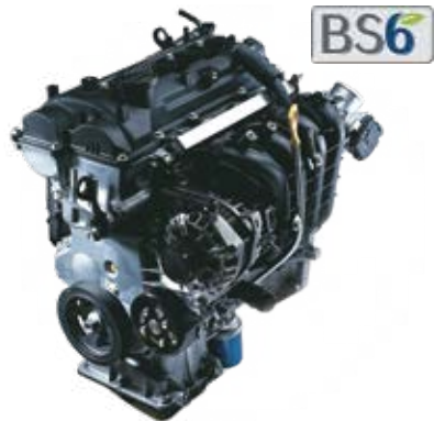
1.2 Kappa Dual VTVT BS6 Petrol Engine

The new BS VI compliant petrol engine in the All New GRAND i10 NIOS makes it a pleasure to drive. So, grab the wheel and get set for a matchless experience. You can also opt for the convenient AMT version in Petrol or Diesel.