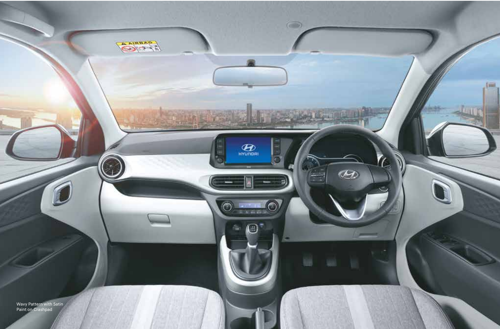
Wavy Pattern with Satin Paint on Crashpad