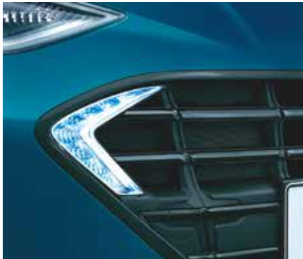
Boomerang Shaped LED DRLs