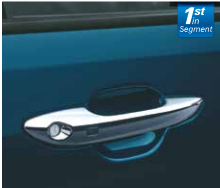
Chrome Door Handles