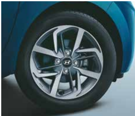
R15 Diamond-cut Alloy Wheels