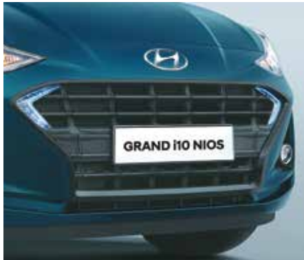
Glossy Black Radiator Grille*

Admire it from any angle, and The All New GRAND i10 NIOS will catch your eye with its bold stance and contemporary design. Check out its new Projector Headlamps & Foglamps for enhanced visibility. Body Coloured Bumpers, Chrome Door Handles and Blacked out B-Pillar & Window Line give it a differentiated road presence.