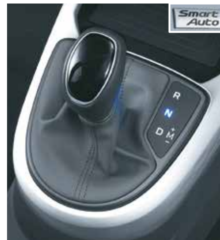
AMT in Petrol & Diesel