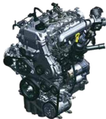
1.2 U2 CRDi Diesel Engine