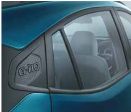
Unique Gi10 Branding on C Pillar