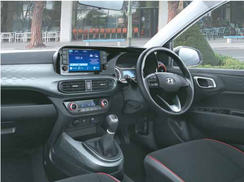
Dual Tone Interior Option

The All New GRAND i10 NIOS gets its smart technology from the Hyundai stable; like the Best-in-segment 20.25 cm Touchscreen Infotainment System with Smartphone Connectivity. Advanced technology is always working behind the scene to make every drive a convenient yet richly immersive experience.