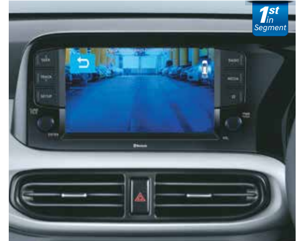
Driver Rear View Monitor