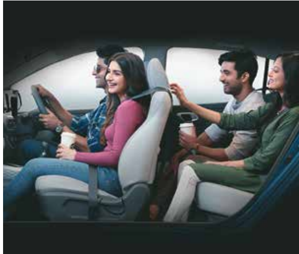
Wide and Spacious Cabin